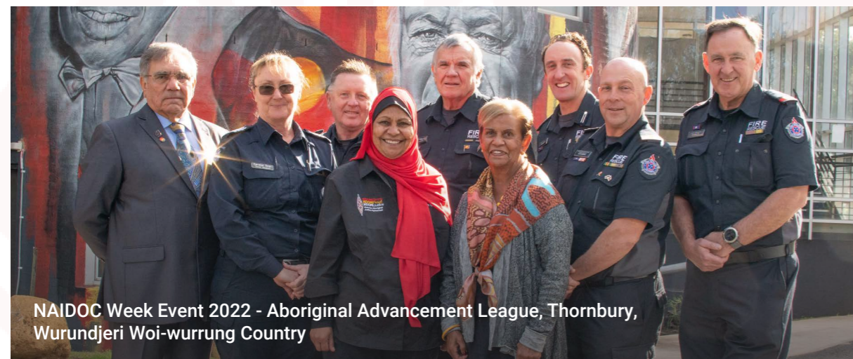
NAIDOC Week Event 2022 - Aboriginal Advancement League, Thornbury, Wurundjeri Woi-wurrung Country